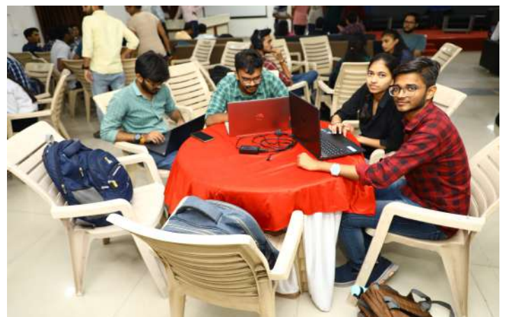
Internal SIH Hackathon 2023 on 26.09.2023