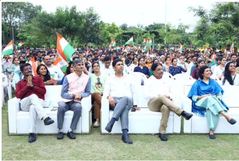
Witnessing the Chandrayan -3 Landing on Moon