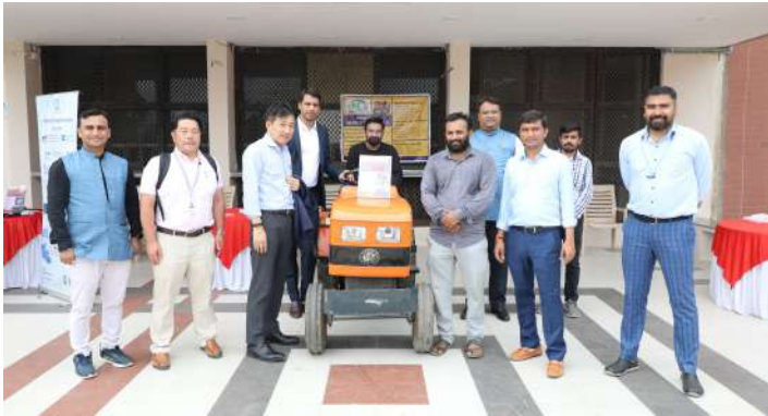
Visit of Foreign Delegates of Toyota Tsusho, Japan at GTU on 04.07.2023