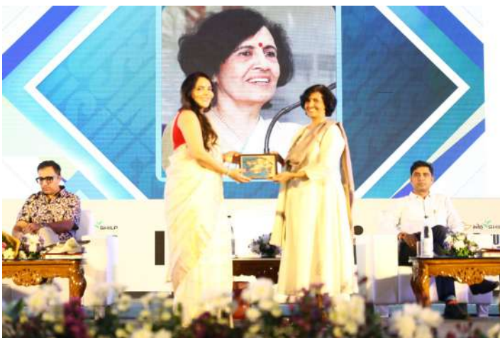
Start-up Fest 2023 on 02.09.2023 & 03.09.2023