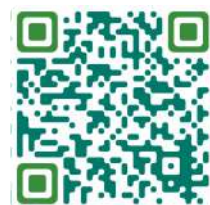
GTU's What's App Channel