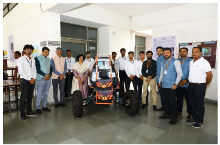
Engineer's Day Celebration on 15.09.2023 & 16.09.2023