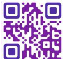
GTU's Social Media Platforms

Share your feedback on: sarthak@gtu.edu.in